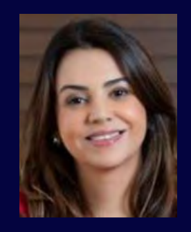
Ministério da Fazenda